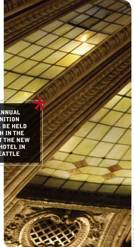
ARCTIC CLUB HOTEL

PLYMOUTH'S ANNUAL DONOR RECOGNITION EVENING WILL BE HELD NOVEMBER 6TH IN THE DOME ROOM AT THE NEW ARCTIC CLUB HOTEL IN DOWNTOWN SEATTLE